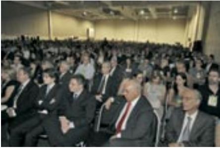
Brazilian Congress of Psychiatry convened almost six thousand participants.