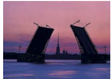
The Palace Bridge, St. Petersburg.

Organizing fee: 400/200 Euros; deadline for early registration: 15 March 2010, after this date 450/230 Euros; from 1 June 2010 480/250 Euros (the list of countries with reduced fee is on the website).