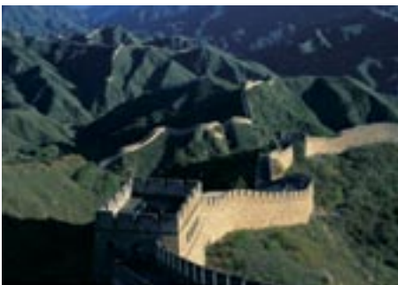
The Great Wall of China.

The WPA International Congress “Global psychiatry at the frontier: sharing the future” will take place in Beijing, China from 1 to 5 September 2010, hosted by the Capital Medical University (CMU) and the Chinese Soci-