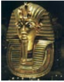
The famous golden mask of King Tut-Anch-Amnoon (King Tut).