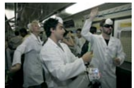
Program aimed at direct contact with the population used theater sketches.