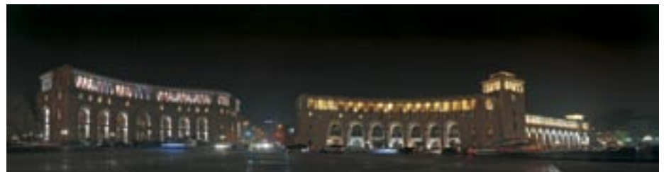
The House of the Government of Armenia in the Republican Square of Yerevan.

Internationally recognized keynote speakers are also invited.