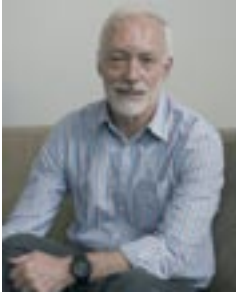
Prof. Patrick McGorry

The Royal Australian and New Zealand College of Psychiatrists congratulates Professor Patrick McGorry on being named the 2010 Australian of the Year.