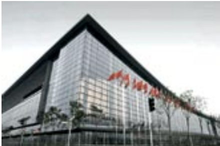
China National Convention Center (CNCC).

“Global psychiatry at the frontier: sharing the future”